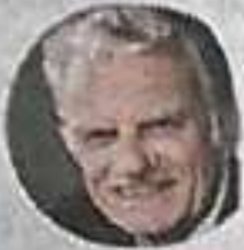
Billy Graham My Answer

Editor's Note: The Rev. Billy Graham, who passed away on Wednesday, wrote this column before he died.